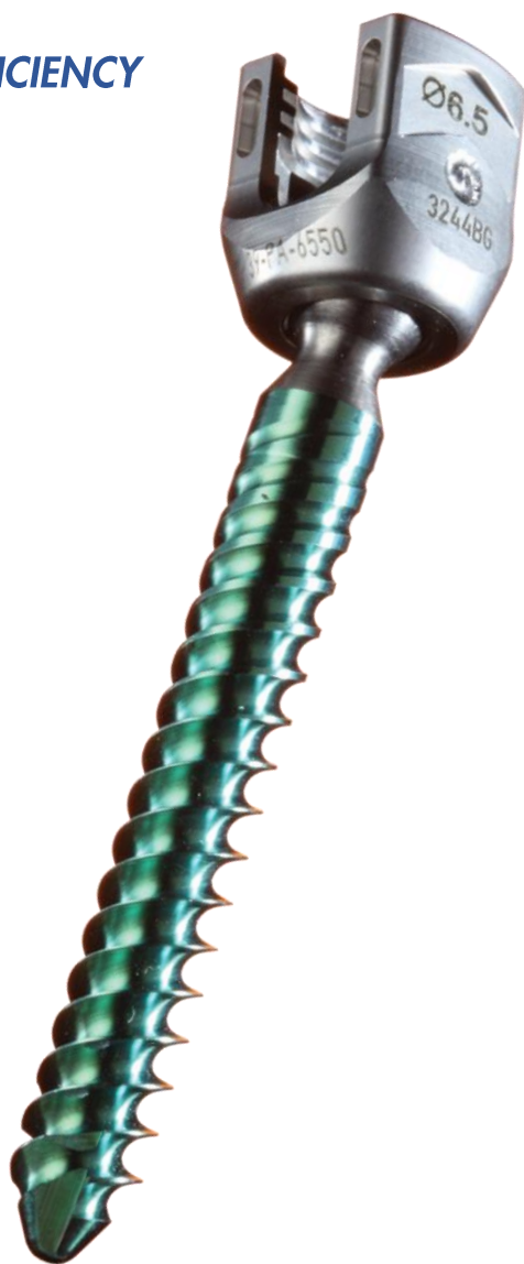
COBALT CHROME TULIP

Reform ® is a comprehensive pedicle screw system that is designed to meet the varying requirements of degenerative, trauma and deformity procedures. Reform features a cobalt chrome tulip, a titanium triple lead proximaly tapered thread and titanium and cobalt chrome rods to deliver strength, stability and efficiency to all thoracolumbar constructs. Reduction and uniplanar screw options, along with a full line of hooks, dominoes and offsets, complete the system to simplify the procedure and accommodate individual patient anatomy.